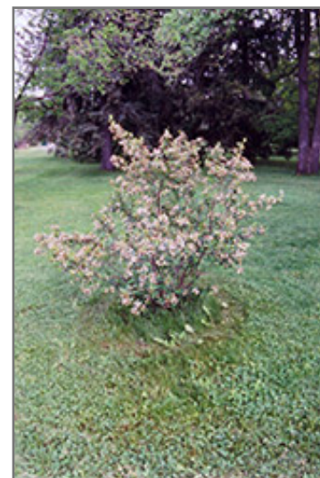
Black Chokeberry in bloom