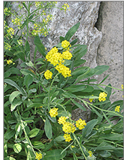
Basket Of Gold Alyssum flowers

Basket Of Gold Alyssum is recommended for the following landscape applications;