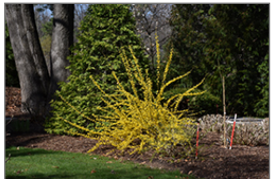
Show Off Forsythia in bloom