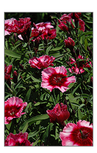
Raspberry Parfait Pinks flowers

Eye catching white flowers with raspberry red centers rise above mounds of fine foliage; great for flower arrangements; deadhead to rebloom; very floriferous with a tidy, uniform habit; sturdy, resilient and easy to grow; excellent in containers