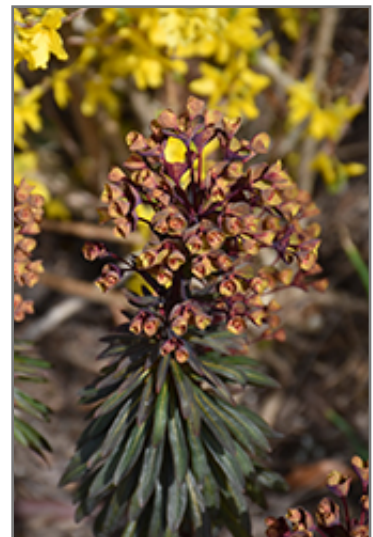
Purple Wood Spurge flower buds