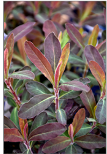
Purple Wood Spurge foliage

Purple Wood Spurge will grow to be about 15 inches tall at maturity, with a spread of 18 inches. When grown in masses or used as a bedding plant, individual plants should be spaced approximately 12 inches apart. Its foliage tends to remain dense right to the ground, not requiring facer plants in front. It grows at a medium rate, and under ideal conditions can be expected to live for approximately 8 years. As an herbaceous perennial, this plant will usually die back to the crown each winter, and will regrow from the base each spring. Be careful not to disturb the crown in late winter when it may not be readily seen!