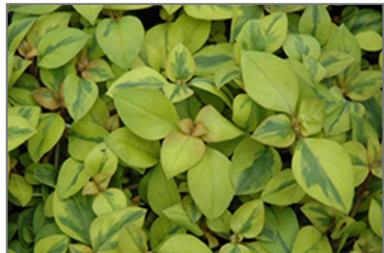
Walkabout Sunset Loosestrife foliage