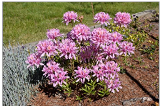
Orchid Lights Azalea in bloom