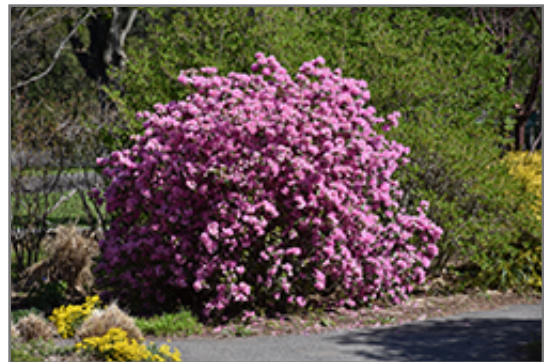
P.J.M. Elite Rhododendron in bloom