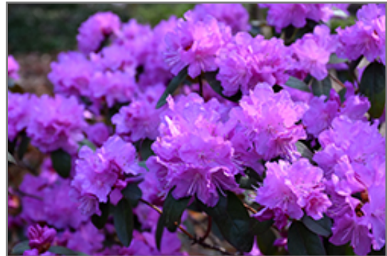
P.J.M. Elite Rhododendron flowers

P.J.M. Elite Rhododendron is recommended for the following landscape applications;