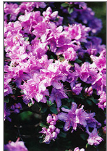
Ramapo Rhododendron flowers