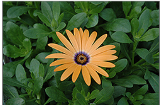
Orange Symphony African Daisy flowers

Orange Symphony African Daisy is recommended for the following landscape applications;