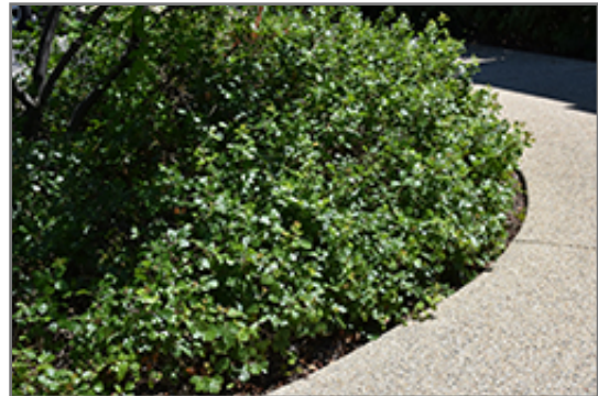
Gro-Low Fragrant Sumac

Gro-Low Fragrant Sumac is recommended for the following landscape applications;