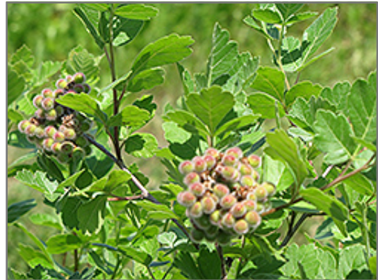
Gro-Low Fragrant Sumac fruit

This shrub performs well in both full sun and full shade. It is very adaptable to both dry and moist locations, and should do just fine under typical garden conditions. It is not particular as to soil type, but has a definite preference for acidic soils, and is subject to chlorosis (yellowing) of the leaves in alkaline soils. It is highly tolerant of urban pollution and will even thrive in inner city environments. Consider applying a thick mulch around the root zone in winter to protect it in exposed locations or colder microclimates. This is a selection of a native North American species.