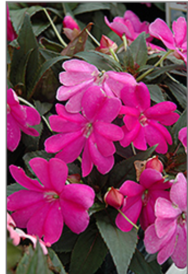
SunPatiens Compact Lilac New Guinea Impatiens flowers

SunPatiens Compact Lilac New Guinea Impatiens is recommended for the following landscape applications;