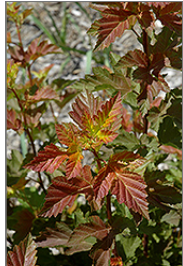
Amber Jubilee Ninebark foliage

This shrub will require occasional maintenance and upkeep, and can be pruned at anytime. It has no significant negative characteristics.