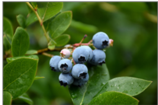
Northcountry Blueberry fruit

Northcountry Blueberry features dainty clusters of white bell-shaped flowers with shell pink overtones hanging below the branches in mid spring. It has green foliage throughout the season. The glossy oval leaves turn an outstanding scarlet in the fall. It features an abundance of magnificent blue berries in mid summer.