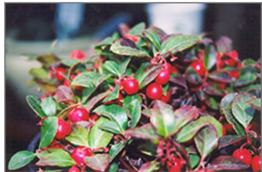
Creeping Wintergreen fruit