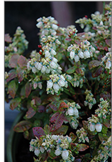
Jelly Bean Blueberry flowers

Jelly Bean Blueberry is a good choice for the edible garden, but it is also well-suited for use in outdoor pots and containers. It can be used either as 'filler' or as a 'thriller' in the 'spiller-thriller-filler' container combination, depending on the height and form of the other plants used in the container planting. It is even sizeable enough that it can be grown alone in a suitable container. Note that when grown in a container, it may not perform exactly as indicated on the tag - this is to be expected. Also note that when growing plants in outdoor containers and baskets, they may require more frequent waterings than they would in the yard or garden. Be aware that in our climate, most plants cannot be expected to survive the winter if left in containers outdoors, and this plant is no exception. Contact our experts for more information on how to protect it over the winter months.