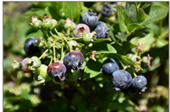
Jelly Bean Blueberry fruit