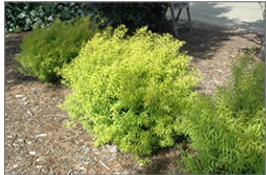
Mellow Yellow Spirea

This is a high maintenance shrub that will require regular care and upkeep, and should only be pruned after flowering to avoid removing any of the current season's flowers. It is a good choice for attracting butterflies to your yard, but is not particularly attractive to deer who tend to leave it alone in favor of tastier treats. It has no significant negative characteristics.