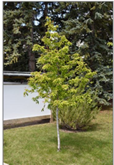
Amur Maple (tree form)