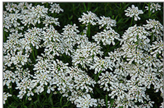
Little Gem Candytuft flowers