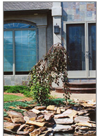
Royal Beauty Flowering Crab