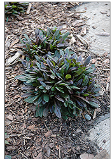
Chocolate Chip Bugleweed