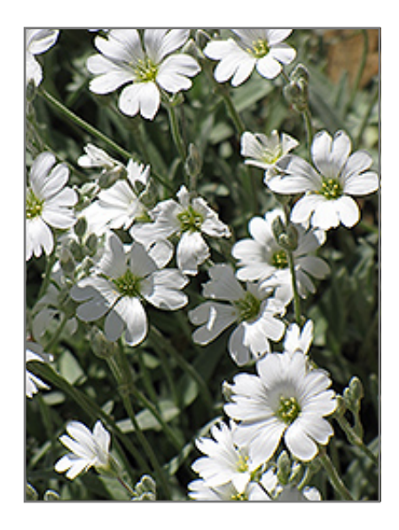
Snow-In-Summer flowers