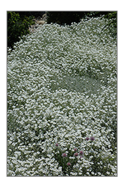
Snow-In-Summer in bloom

Snow-In-Summer will grow to be about 8 inches tall at maturity, with a spread of 24 inches. Its foliage tends to remain low and dense right to the ground. It grows at a fast rate, and under ideal conditions can be expected to live for approximately 10 years. As an evegreen perennial, this plant will typically keep its form and foliage year-round.