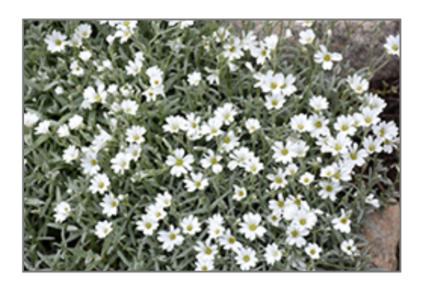
Snow-In-Summer flowers

This is a high maintenance plant that will require regular care and upkeep, and should only be pruned after flowering to avoid removing any of the current season's flowers. Deer don't particularly care for this plant and will usually leave it alone in favor of tastier treats. Gardeners should be aware of the following characteristic(s) that may warrant special consideration;