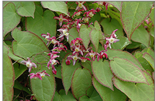
Bishop's Hat flowers

Bishop's Hat is recommended for the following landscape applications;