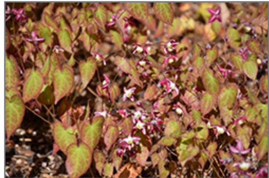
Bishop's Hat in bloom

Bishop's Hat will grow to be about 12 inches tall at maturity, with a spread of 18 inches. When grown in masses or used as a bedding plant, individual plants should be spaced approximately 15 inches apart. Its foliage tends to remain dense right to the ground, not requiring facer plants in front. It grows at a medium rate, and under ideal conditions can be expected to live for approximately 10 years.