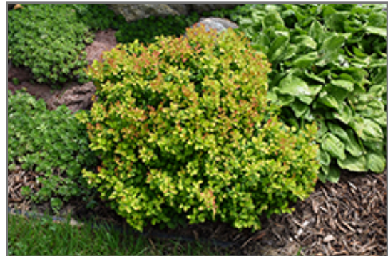
Limoncello Barberry