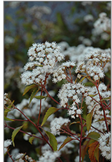
Chocolate Boneset flowers

This is a relatively low maintenance plant, and is best cleaned up in early spring before it resumes active growth for the season. It is a good choice for attracting butterflies to your yard, but is not particularly attractive to deer who tend to leave it alone in favor of tastier treats. It has no significant negative characteristics.