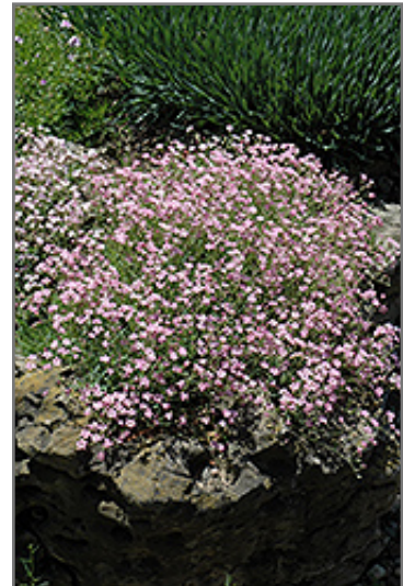
Pink Creeping Baby's Breath in bloom