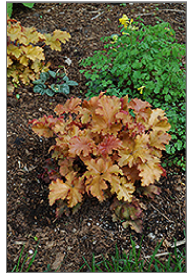
Amber Waves Coral Bells

Amber Waves Coral Bells is a dense herbaceous evergreen perennial with tall flower stalks held atop a low mound of foliage. Its relatively fine texture sets it apart from other garden plants with less refined foliage.