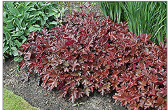
Chocolate Ruffles Coral Bells

Chocolate Ruffles Coral Bells is a dense herbaceous evergreen perennial with tall flower stalks held atop a low mound of foliage. Its relatively fine texture sets it apart from other garden plants with less refined foliage.