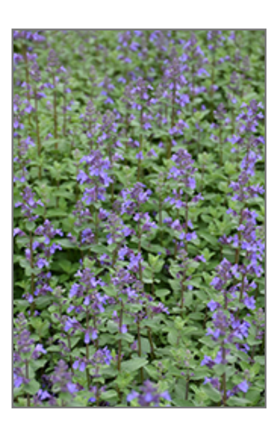
Blue Wonder Catmint flowers

Blue Wonder Catmint has masses of beautiful spikes of lightly-scented royal blue flowers with powder blue overtones rising above the foliage from late spring to early fall, which are most effective when planted in groupings. Its small fragrant pointy leaves remain grayish green in color throughout the season.