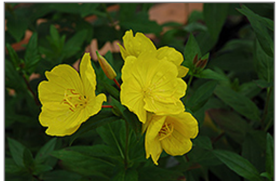
Yellow Sundrops flowers