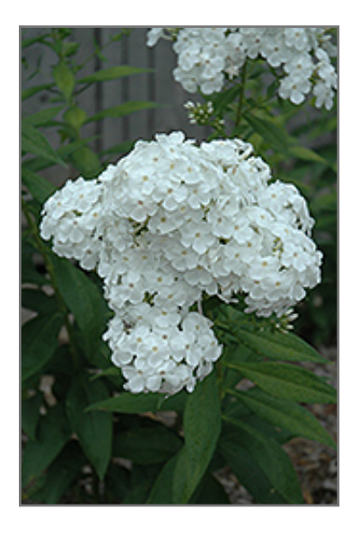
David Garden Phlox flowers