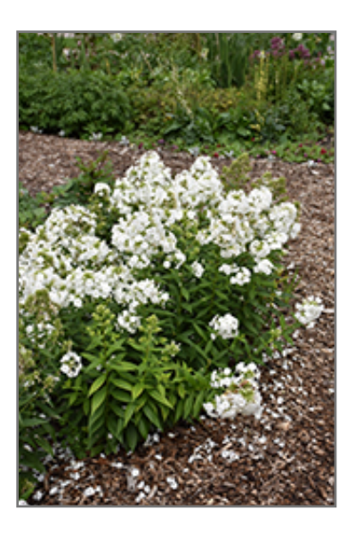
David Garden Phlox in bloom