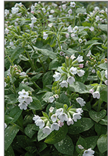
Sissinghurst White Lungwort flowers