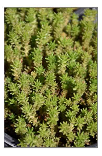
Six Row Stonecrop foliage

This plant does best in full sun to partial shade. It prefers dry to average moisture levels with very well-drained soil, and will often die in standing water. It is considered to be drought-tolerant, and thus makes an ideal choice for a low-water garden or xeriscape application. It is not particular as to soil pH, but grows best in poor soils, and is able to handle environmental salt. It is highly tolerant of urban pollution and will even thrive in inner city environments. This species is not originally from North America. It can be propagated by division.