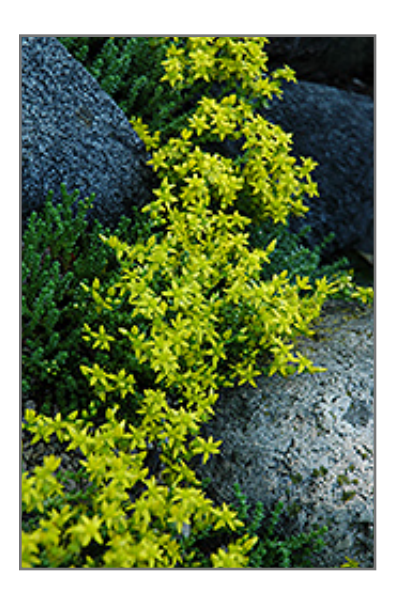
Six Row Stonecrop flowers