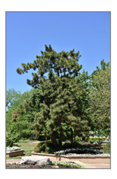
Japanese Black Pine

Japanese Black Pine is recommended for the following landscape applications;