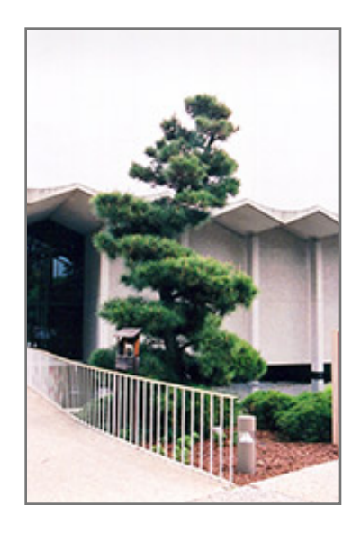
Japanese Black Pine (topiary form)