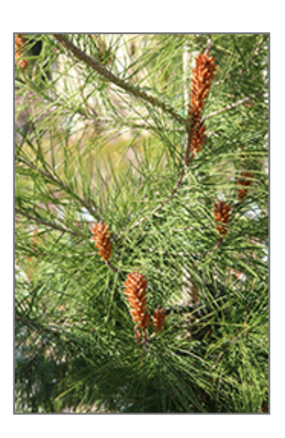
Japanese Black Pine fruit