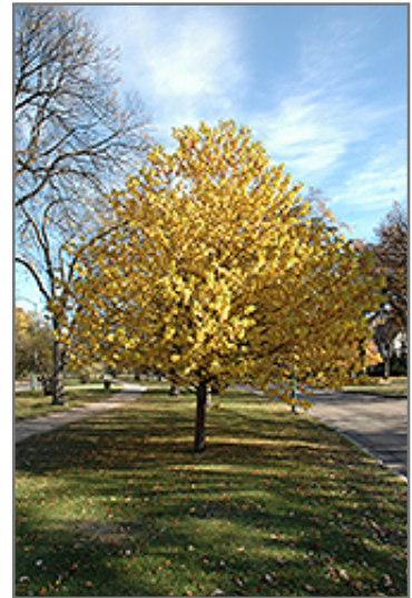
Amur Cherry in fall

* This is a 'special order' plant - contact store for details