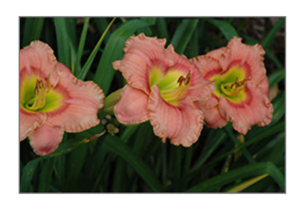
Elegant Candy Daylily flowers