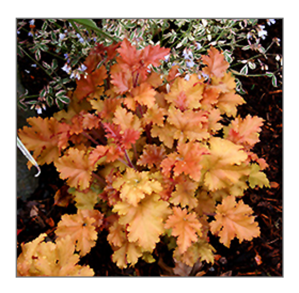
Marmalade Coral Bells foliage

Marmalade Coral Bells will grow to be about 8 inches tall at maturity extending to 18 inches tall with the flowers, with a spread of 16 inches. When grown in masses or used as a bedding plant, individual plants should be spaced approximately 14 inches apart. Its foliage tends to remain low and dense right to the ground. It grows at a medium rate, and under ideal conditions can be expected to live for approximately 10 years. As an evegreen perennial, this plant will typically keep its form and foliage year-round.