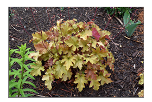
Marmalade Coral Bells