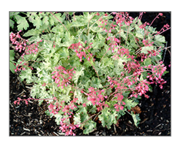
Monet Coral Bells in bloom

Beautiful green and white foliage grow in easy to care for mounds; adaptable in various conditions; tall spikes of ruby-pink flowers make an appearance in early summer; adds contrast and intrigue to borders, beds, rock and woodland gardens