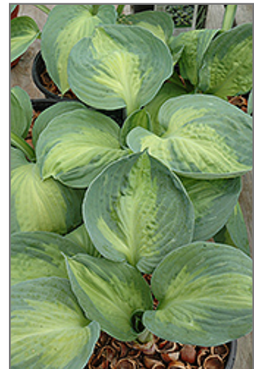
Adrian's Glory Hosta foliage