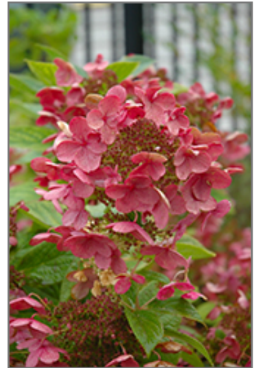
Quick Fire Hydrangea flowers (faded)

* This is a 'special order' plant - contact store for details