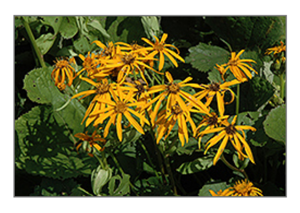
Othello Rayflower flowers