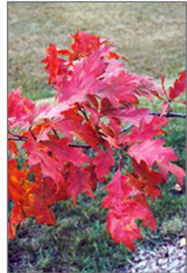
Red Oak in fall

This tree should only be grown in full sunlight. It prefers to grow in average to moist conditions, and shouldn't be allowed to dry out. It is not particular as to soil type, but has a definite preference for acidic soils, and is subject to chlorosis (yellowing) of the leaves in alkaline soils. It is highly tolerant of urban pollution and will even thrive in inner city environments. This species is native to parts of North America.