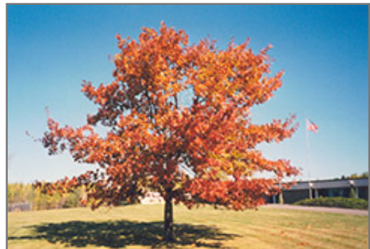
Red Oak in fall