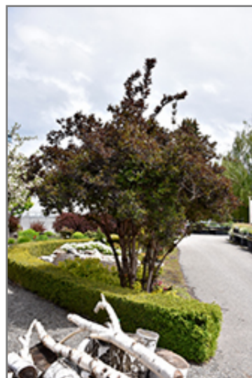
Black Beauty Elder