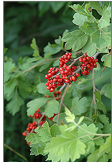
Fragrant Sumac fruit