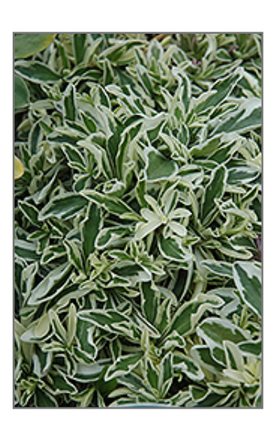
Variegated Wall Cress foliage

Variegated Wall Cress is blanketed in stunning lightly-scented white daisy flowers with lemon yellow eyes at the ends of the stems from mid to late spring. Its attractive small narrow leaves remain olive green in color with showy creamy white variegation throughout the year.