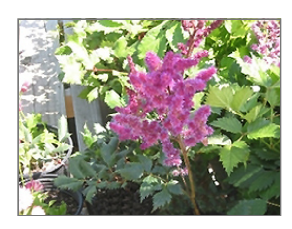
Granat Astilbe flowers

Striking carmine-red plumes rising above glossy leaves; foliage is bronze-green in spring; perfect in a shady spot with dappled light; prefers moisture so water regularly for abundant flowers and nice foliage