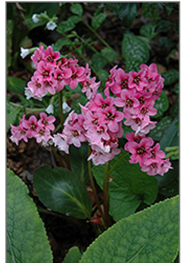
Pink Dragonfly Bergenia flowers

Pink Dragonfly Bergenia is recommended for the following landscape applications;