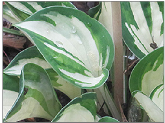
Pandora's Box Hosta foliage

This is a relatively low maintenance plant, and is best cleaned up in early spring before it resumes active growth for the season. Gardeners should be aware of the following characteristic(s) that may warrant special consideration;