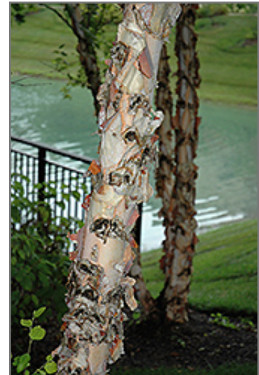
River Birch bark