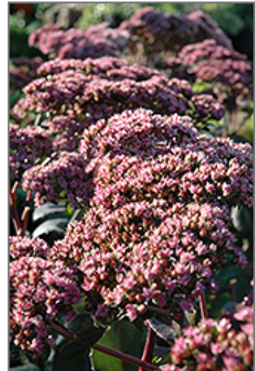
Maestro Stonecrop flowers

Maestro Stonecrop is a dense herbaceous perennial with an upright spreading habit of growth. Its relatively coarse texture can be used to stand it apart from other garden plants with finer foliage.